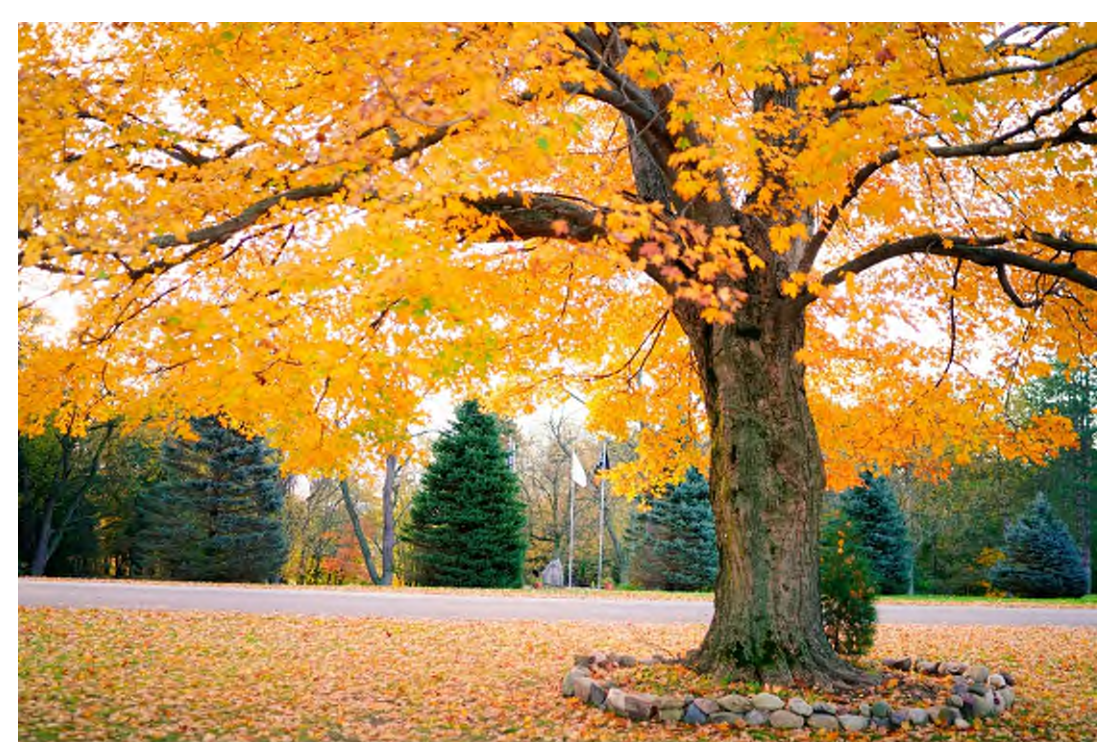
Photo: Grandfather maple tree located just outside of the Health and Human Services Department

The Potawatomi Nation historically encompassed lands along the Southeastern shoreline of Lake Michigan, from Detroit to Grand Rivers, and south into Northern Indiana, Ohio and Illinois. During a period of removal referred to as the Trail of Death, the Potawatomi were forced west of the Mississippi. A group of Tribal Members escaped and returned to their native lands in Michigan where the Nottawaseppi Huron Band of the Potawatomi Tribe resides currently, on the Pine Creek Indian Reservation in Fulton, Michigan.