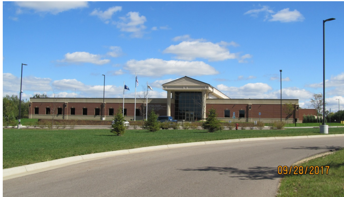
Marshall Regional Law Enforcement Center

Prepared for the Calhoun County Board of Commissioners