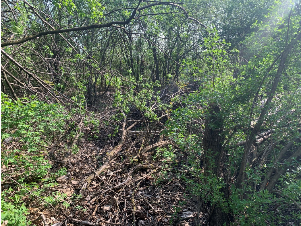
Photo 1. Deadfall in ComEd ROW