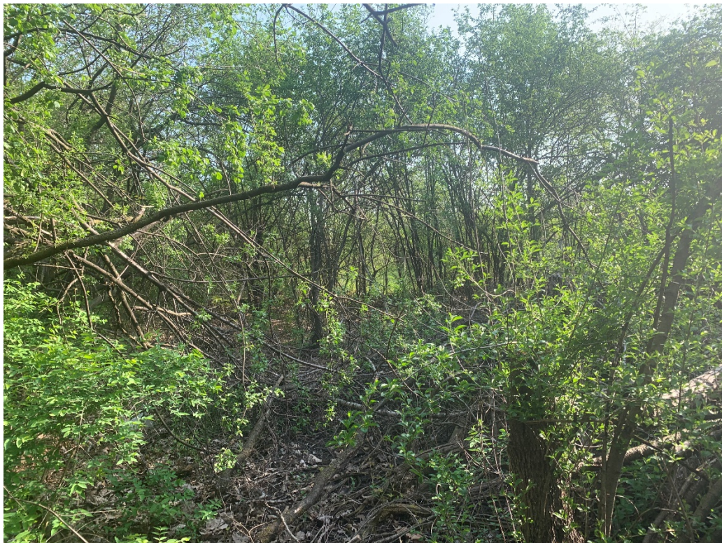
Photo 2. Dead Tree in ComEd ROW