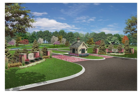
Artist Rendering of Lakeside Pointe Entry at Bridewell Drive

Plan Commission/Zoning Board of Appeals - The Plan Commission/Zoning Board of Appeals conducts public hearings and makes recommendations to the Village Board regarding re-quests for zoning variations, rezoning of land, special use approvals, amendments to the Zoning Ordinance, Planned Unit Developments and new plats of subdivision. The Commission has scheduled meetings on the first and third Monday of each month. In 2018, the Commission held 15 meetings which included public hearings for 9 zoning variations, 4 hearings for rezoning of land, 15 special use requests, 8 text amendments to the Zoning Ordinance, as well as 2 Planned Unit Development and an amendment to a Planned Unit Development. The special use approvals included the approval of a McDonald's at Spectrum Senior Living and a custom art studio and a dog training facility at County Line Square. A big thank you to the current members of the Plan Commission/Zoning Board of Appeals for all their hard work. Committee members are: Chairman Greg Trzupek, Commissioners Mike Stratis, Barry Irwin, Janine Farrell, Luisa Hoch, Jim Broline, Mary Praxmarer, and Joe Petrich (alternate).