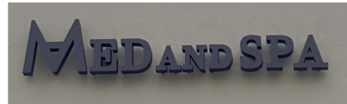
New Med and Spa in County Line Square.