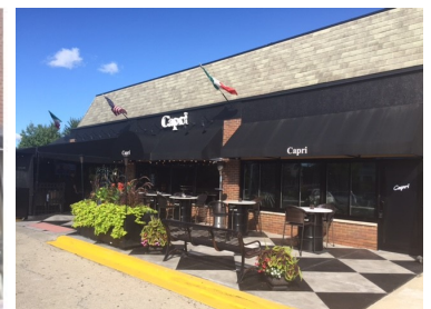
Capri Restaurant Expansion