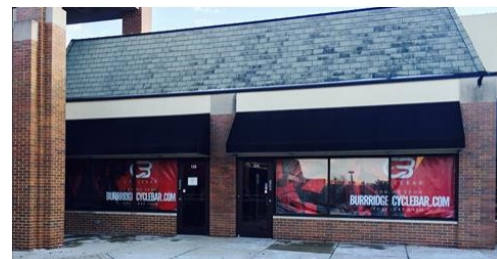
New CycleBar Franchise in County Line Square.