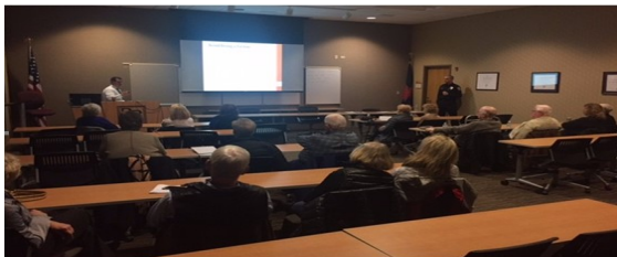
Identity Theft/Scam Alert Seminar

Residents were also presented with an Identity Theft/Scam Alert Seminar in December to give them ideas on how to identify and combat various scams - mail, phone, in person, and online. More seminars like this will be scheduled for the coming year. Check the website, www.burr-ridge.gov for more information.