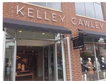
New Kelley Cawley Store

Economic Development Committee - Three more new businesses opened up in the Village Center this year. Women's boutique store Kelley Cawley, the Jockey Store, and 1st Family Dental. Major improvements to the Village Green included a new fire pavilion with comfortable Adirondack seating, as well as some wicker and cushion seating along the sides of the Village Green, and the addition of some long benches and landscaping pots in front of select stores helped to increase the availability of seating and improve the aesthetics of the Village Center. County Line Square also welcomed a few new tenants. With the opening of CycleBar - a spin studio located in the southeast corner, Med and Spa, and the expansion of Capri Restaurant, the southeast corner of Burr Ridge has gotten very busy! Luckily, new parking spaces were added this year to help accommodate all the increased traffic.