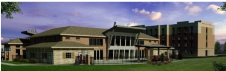
Rendering of proposed Hampton Inn and Falls Event Center.

The Community Development Department provides staff support to the Plan Commission and Pathway Commission and is responsible for the administration of the Zoning, Sign, Subdivision, and Building Ordinances. The Department issued a total of 356 permits in 2016, and increase from 266 in 2015. There were 24 new home permits in 2016 compared to 21 in 2015. Total construction value in 2016 exceeded $17 million for an average home construction value of $717,525. Total construction activity is estimated at a value of just under $60 million. Permits in 2016 included a permit for the Spectrum Senior Living building at 16W301 91 st Street and the Hampton Inn hotel at 100 Harvester Drive.