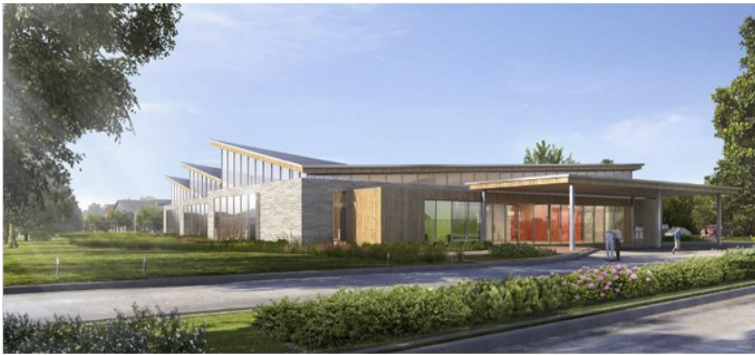
Rendering of proposed Rehabilitation Institute of Chicago.

Plan Commission/Zoning Board of Appeals - The Plan Commission (which also acts as the Zoning Board of Appeals) conducts public hearings and makes recommendations to the Village Board regarding requests for zoning variations, rezoning of land, special use approvals, amendments to the Zoning Ordinance, Planned Unit Developments and new plats of subdivision. The Commission has scheduled meetings on the first and third Monday of each month. In 2016, the Commission held 11 meetings which included public hearings for 15 zoning variations, 4 hearings for rezoning of land, 6 special use requests, 6 text amendments to the Zoning Ordinance, and a Planned Unit Development, and an amendment to a Planned Unit Development. The new Planned Unit Development was for a 52 home empty nester housing project on 22.5 acres at Bridewell Drive and Burr Ridge Parkway. The special use approvals included the expansion of Coopers Hawk Restaurant and 2 new stores at the Village Center and approval of a new medical building for the Rehabilitation Institute of Chicago at 7600 County Line Road. A big thank you to the current members of the Plan Commission/Zoning Board of Appeals for all their hard work. Committee members are: Chairman Greg Trzupek, Commissioners Mike Stratis, Dehn Grunsten, Luisa Hoch, Bob Grella, Greg Scott, Jim Broline, and Mary Praxmarer.