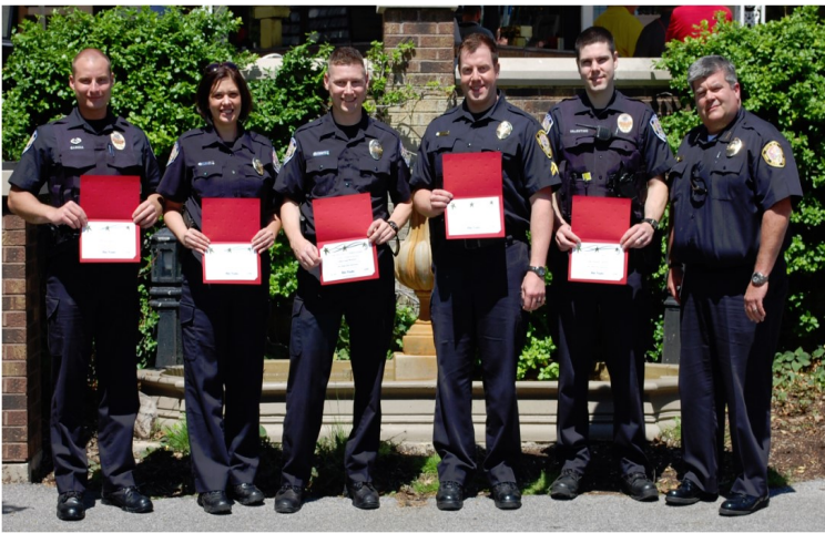
Burr Ridge Officers accept "Top Cop Awards" for DUI arrests.