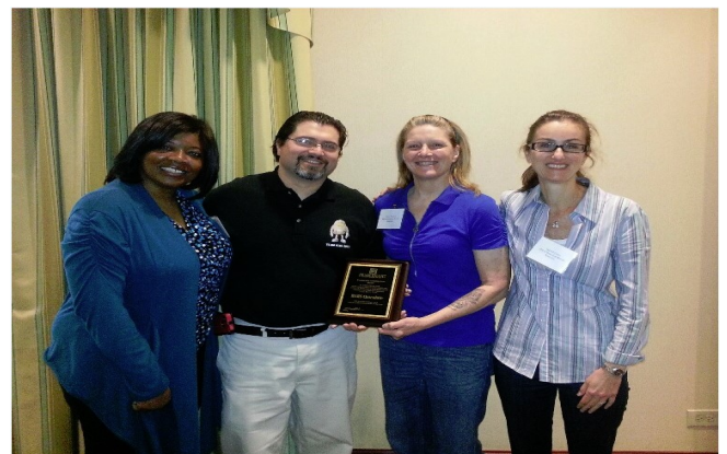
MARS Chocolate Employees accept Community Appreciation Award.