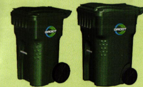
65 Gallon Recycle Cart 95 Gallon Refuse Cart

- Friday pick up of all homes North of 79th Street.