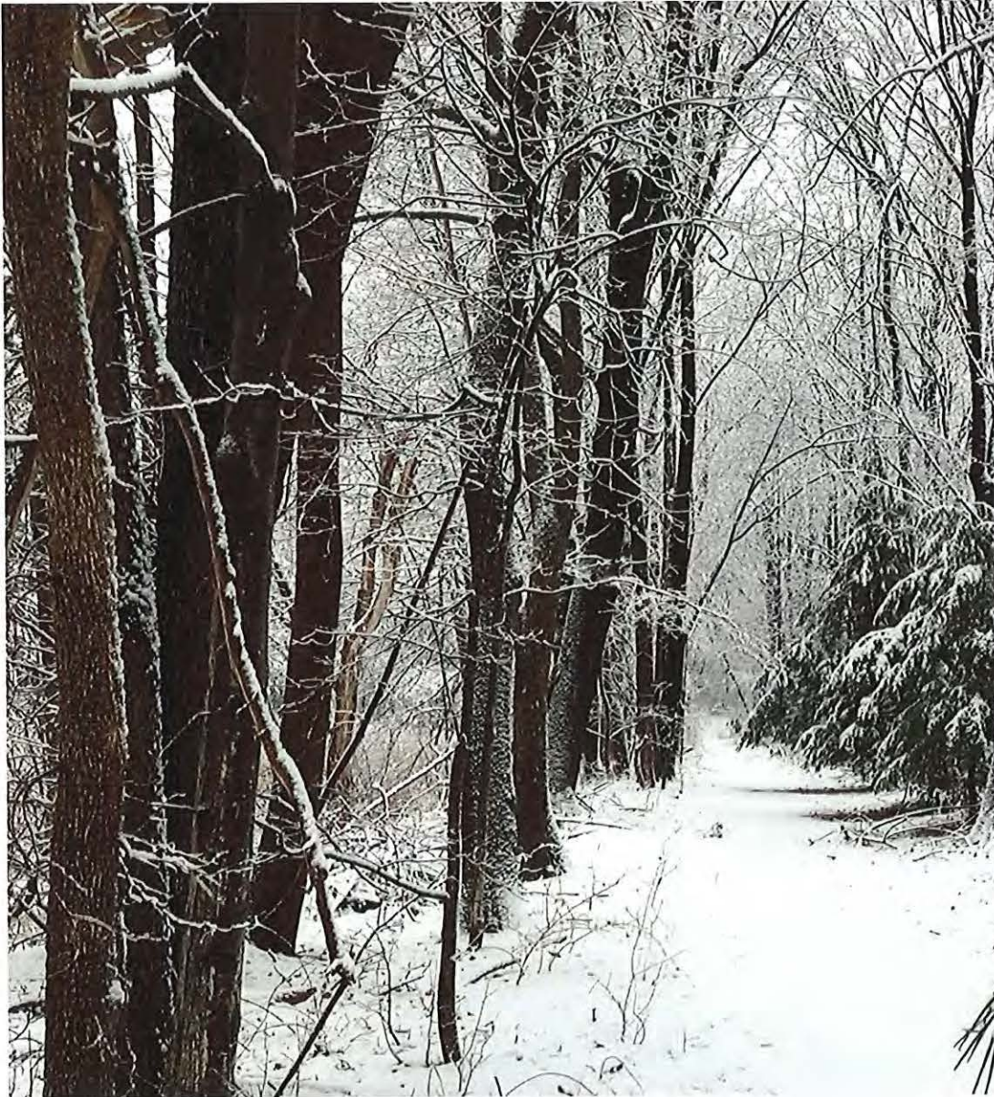
Snowstorm January 21, 2023