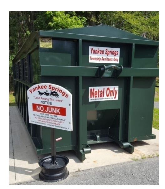
Metal recycling roll-off container at Yankee Springs Township.

There is some interest by others to utilize the Hastings Township model to offer recycling, however; the cost of the unit and contamination concerns have impacted decision making. Purchasing a recycling module, with optional solar panel, is an investment in a municipal recycling drop-off program that may present financial benefit over the traditional method of using a private-sector recycling hauler to equip and service the municipally funded recycling drop-off