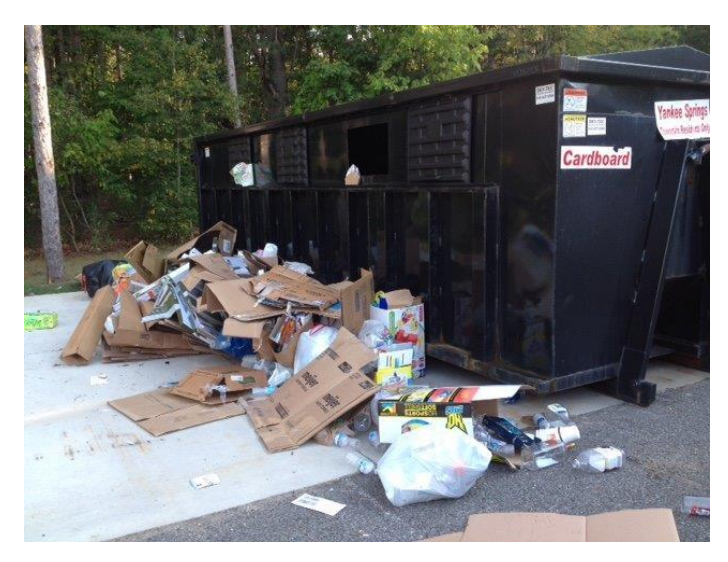
Recyclable material left outside of full recycling container in Yankee Springs Township.