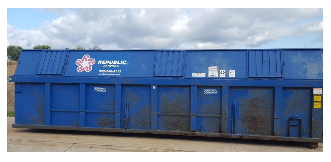
Hope Township recycling roll-off container.