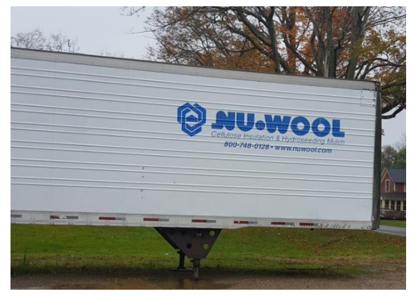
The Nu-Wool newspaper recycling trailer in Delton provides financial support to the local Boy Scout Troop.