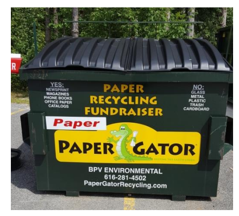
Schools and churches get paid for paper recycled in the PaperGator® recycling bin.