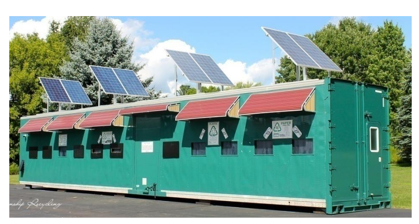
Hastings Township recycling module is equipped with solar panels to bring added benefit to the Township.

This "source-separated" method of recycling allows Hastings Township the flexibility to sell the recyclable commodities directly to processors. In this model, commodities with market value bring revenues that offset commodities with low or no value. Additionally, the recycling module is engineered with a solar panel and generates energy to power the Township office building.