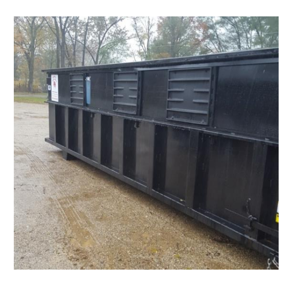
Recycling roll-off in Orangeville Township.

Hope, Orangeville, and Prairieville Townships work with a single-hauler to provide collection service for recycling roll-off containers which accept household plastic, metal, glass, paper and cardboard. Materials are placed all together in the recycling bin, which is referred to in the recycling industry as single-stream recycling.