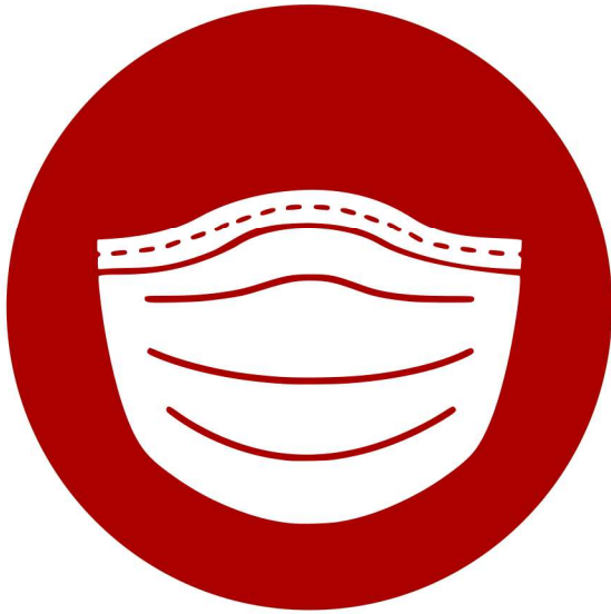
Wear a Mask