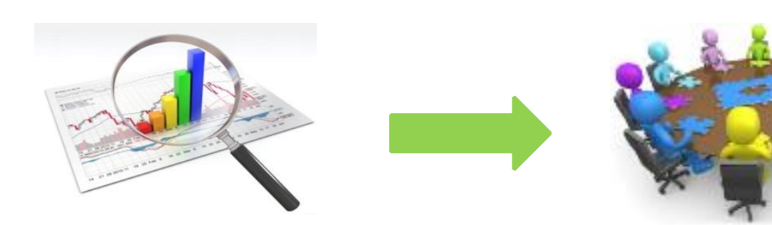
Community Health Assessment

Implementation of the CHIP will begin in early 2018. Advisory committee members have planned to meet quarterly to update members on the status of their activities. An annual report will be published outlining the progress made towards achieving the goals detailed in the work plans, or any revisions that have been made. The improvement plan is to be implemented through 2019.