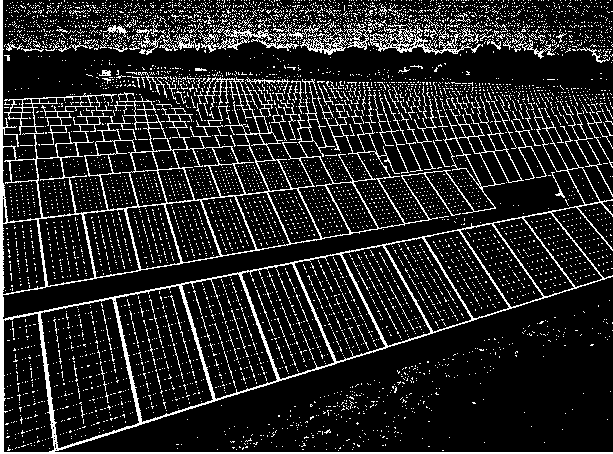
Minnesota Municipal Power Agency's 7 MW Buffalo Solar Buffalo, MN