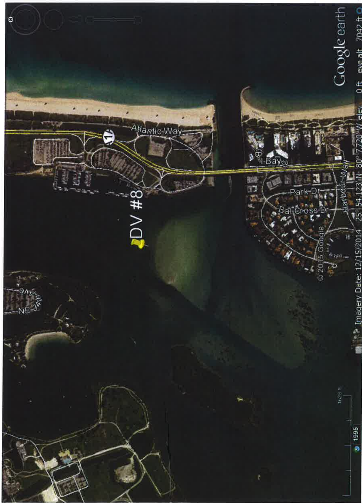
Location Map – Derelict vessel 8 in the vicinity of Haulover Cut – Approximately 120 yards east of the ICW.